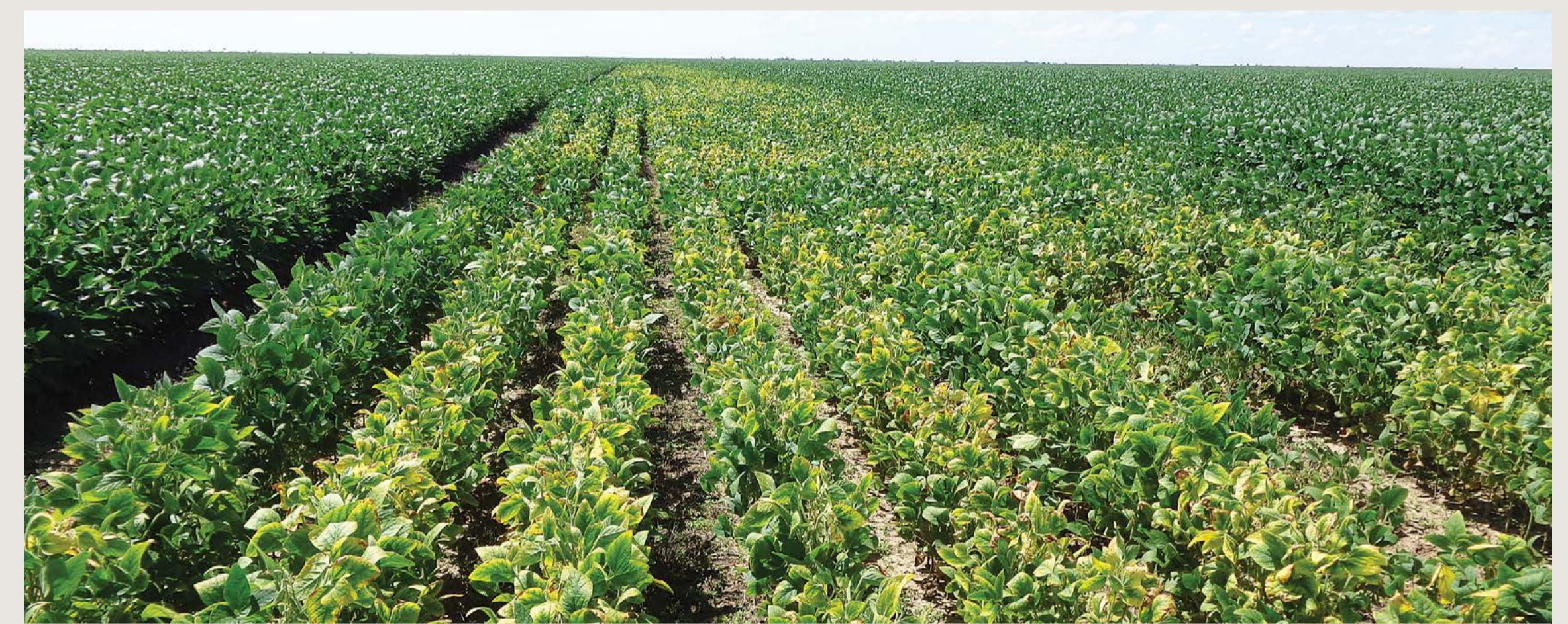
Soybean trial - potassium deficiency in MAP treatment