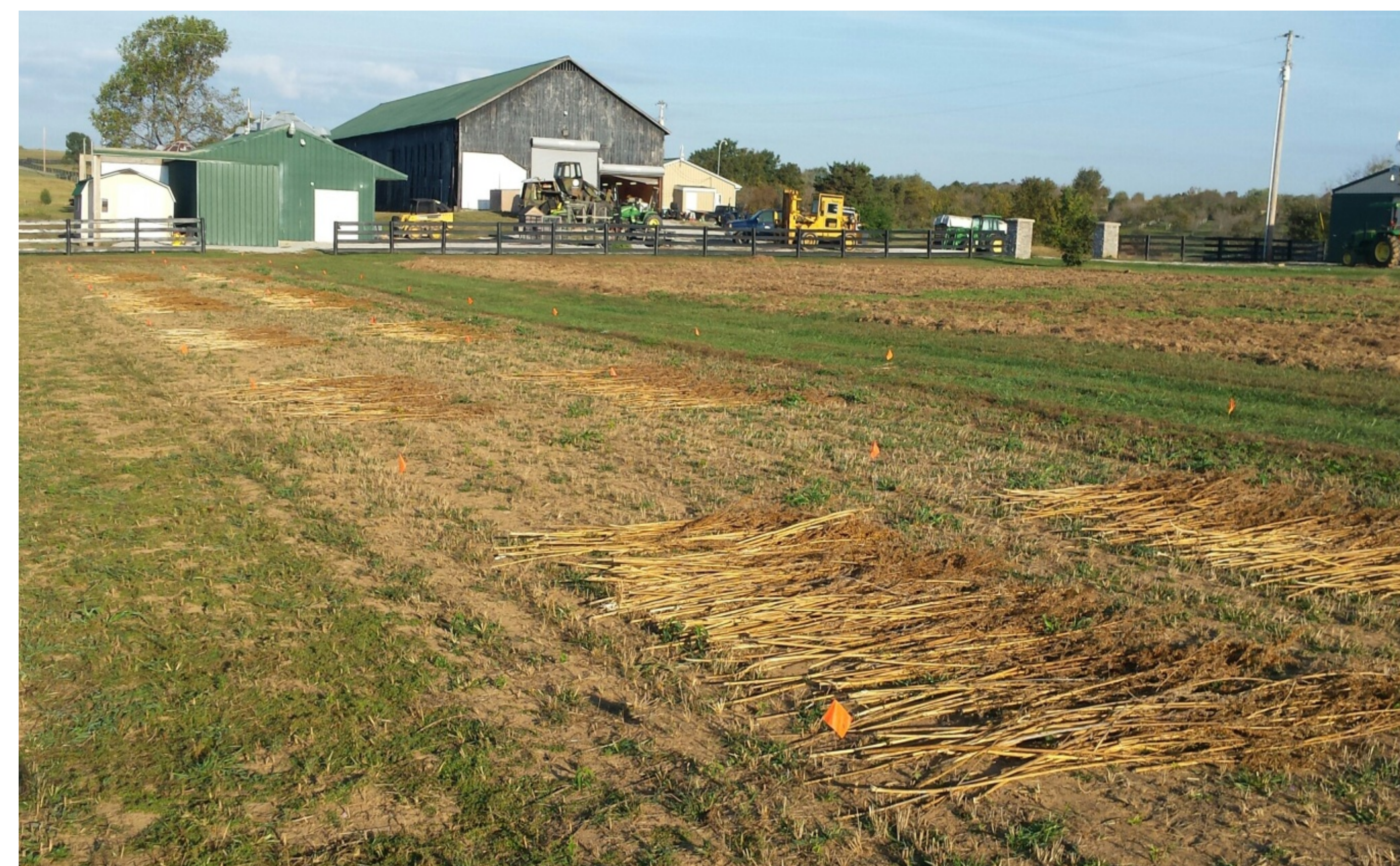
Figure 2. Industrial hemp crop being field-retted as part of this experiment conducted at Kentucky State University's Harold R. Benson Research and Demonstration farm in 2016.