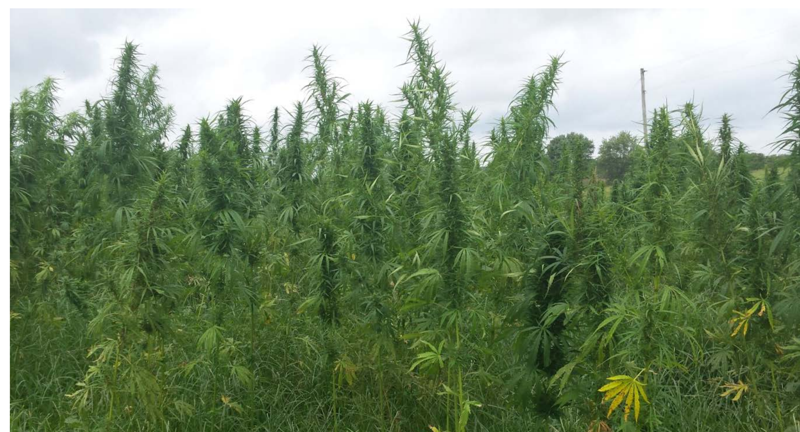
Figure 1. Industrial hemp at Kentucky State University's Harold R. Benson Research and Demonstration farm, grown as part of the Kentucky Industrial Hemp Pilot Program in 2016.